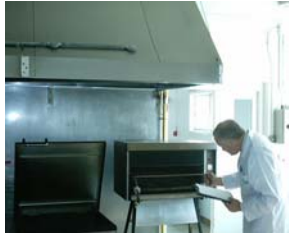
Kitchen Risk Assessment

Under the Health and Safety at Work Act and successive regulations, certain equipment, representing a higher level of danger , is required to have periodic inspection by an independent and impartial “ competent person ”.