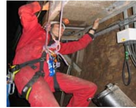
Underground Walkway inspection utilising rope access