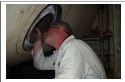
Boiler waterside inspection.