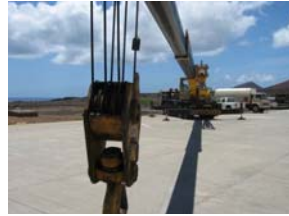
Mobile crane inspection