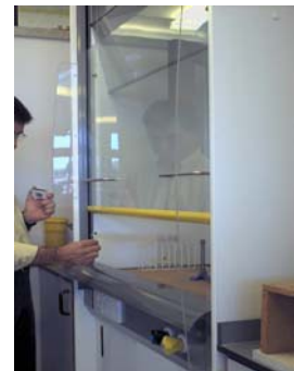
Fume cupboard LEV inspection