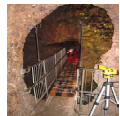
Structural examination and load test of underground bridge