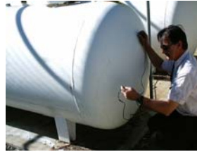
LPG Tank NDT Inspection