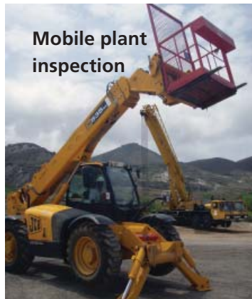
Mobile plant inspection